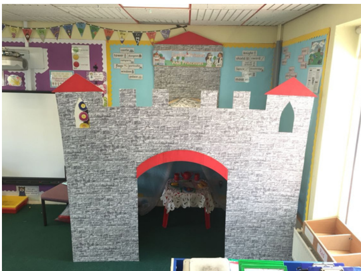
Fairytale Carboard castle