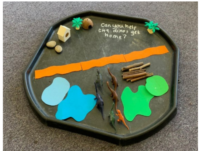
Fairytale Coconut houses, rocks, wooden huts, cutouts of paper, sticks, dinosaur figurines