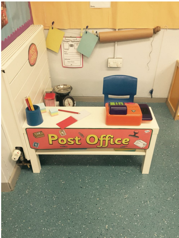
Post office role play area