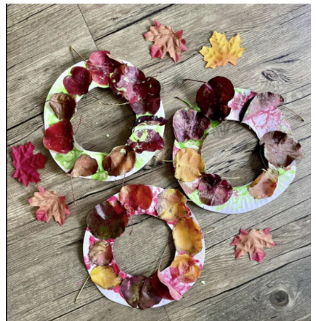
Nature Art Paper plate wreaths, leaves collected on nature walk), pva glue