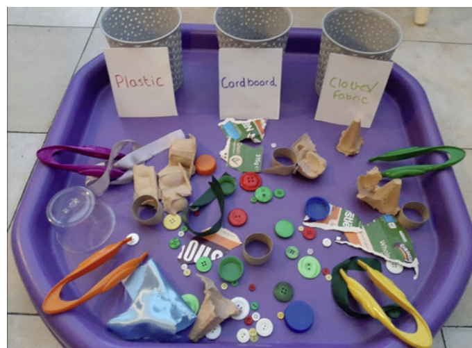
Fine motor sorting activity