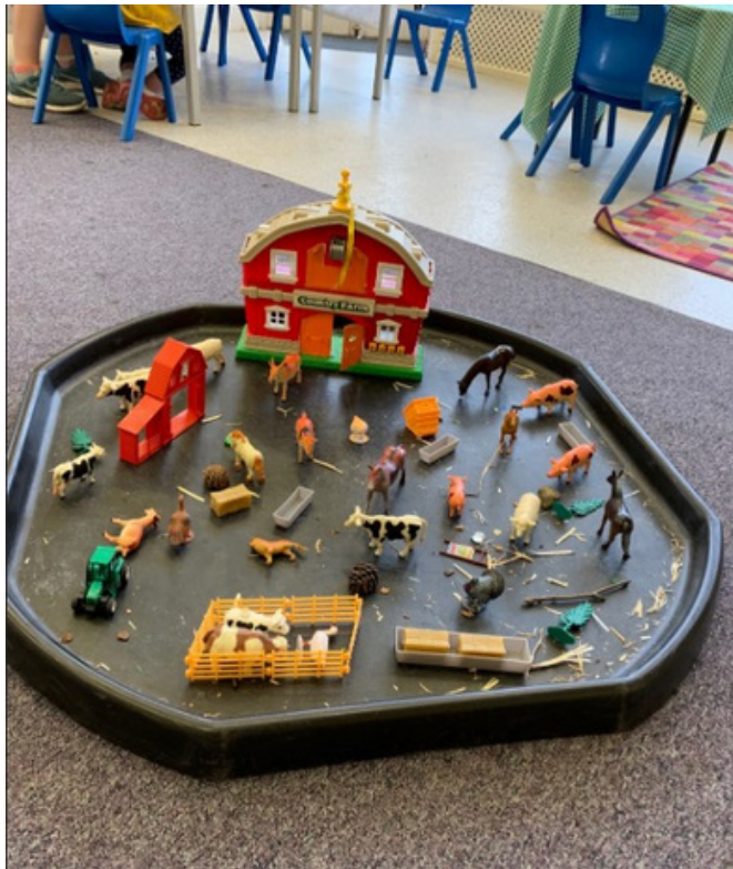
Fairytale Farmyard animals, tractors, plastic fencing, farm building