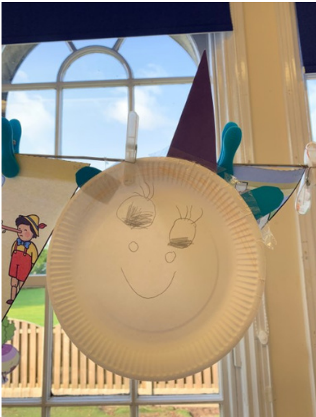
Fairy tales Paper plate animals Paper plate, pencils & card