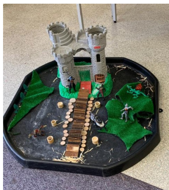
Fairytale Theme Grass scraps, toy bridge, wooden circles, a castle, treasure for inside the castle, dragon and knight figurines