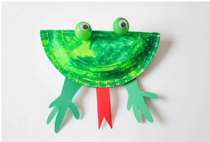
Paper plate frogs Paper plates cut in half or folder over, green pen or pencil, cut-outs for legs and tongue, googly eyes and polystyrene balls