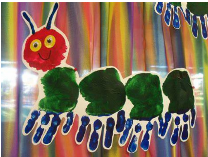
The very hungry caterpillar Washable paint for handprints on white card