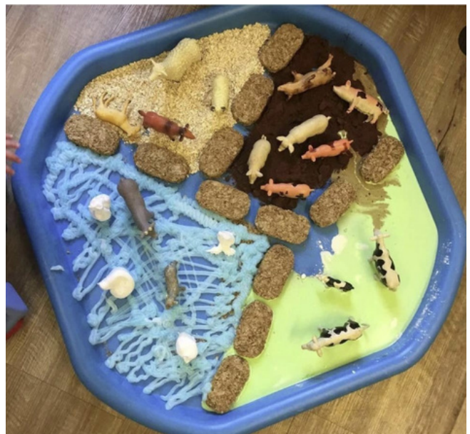
Fairy tale Weetabix as hay bales, oats, shaving foam, mud, green oobleck (water and corn flour)