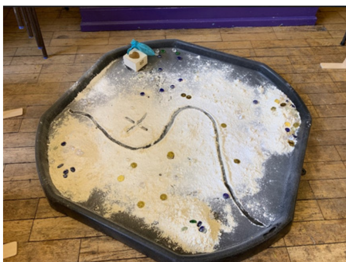
Fantasy or Under the sea Theme Flour, glass beads, plastic coins, treasure chest