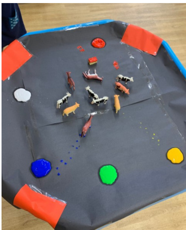
Fairytale Theme Black or coloured paper, paint, farm animals, small farm objects