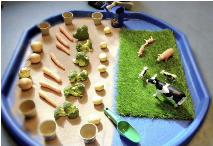
Fairy tale A selection of vegetables, a strip of artificial grass, a plastic shovel, cups for collecting