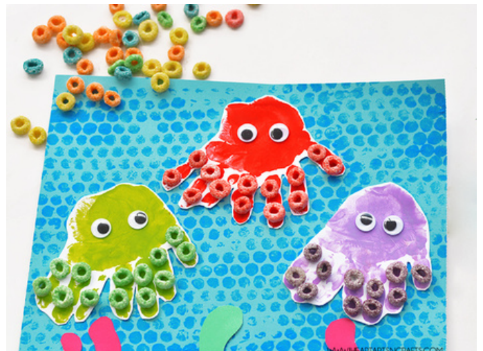
Handprint octopus Coloured cheerios, googly eyes, washable paint for handprints