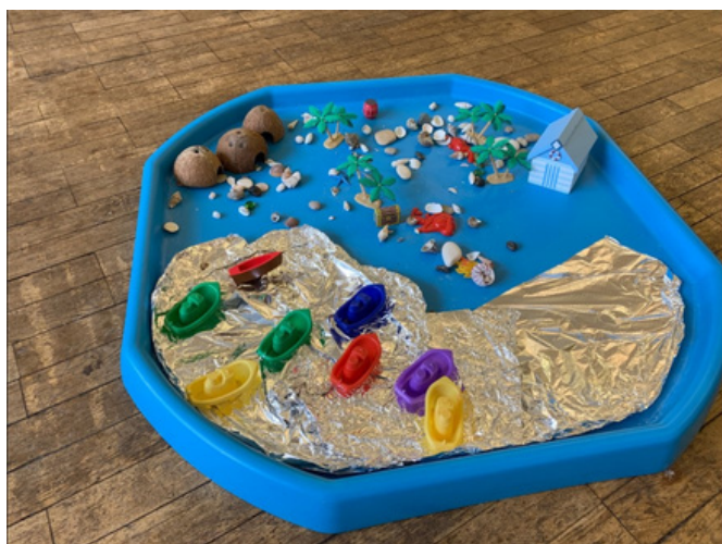
Under the Sea Theme Boats, Tin foil, shells, pebbles, plastic trees, coconut houses