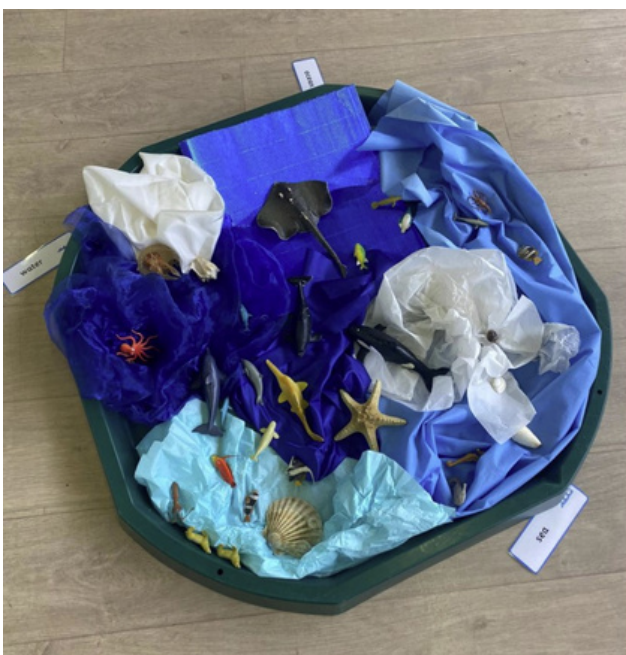
Under the Sea Blue material bags and cloth, plastic sea creatures