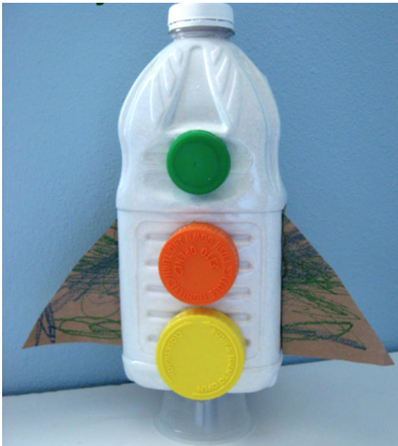
Recycled drinks bottle rocket Large bottle, cardboard wings, coloured bottle tops