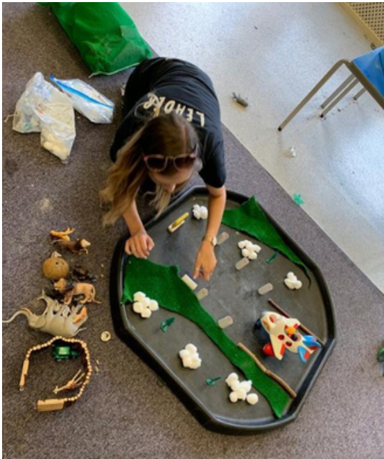
Around the world Theme Grass off cuts, cotton wool, sticks, cardboard circles, wooden sticks