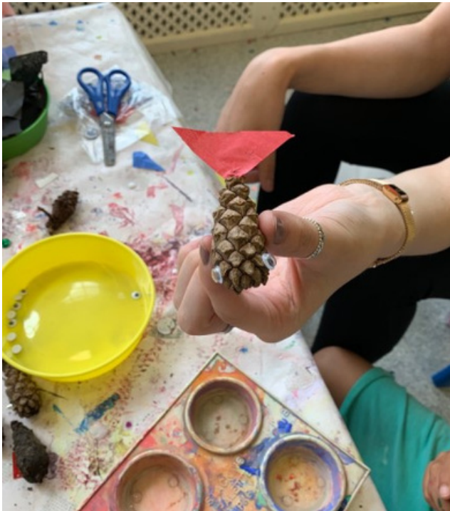
Under the Sea Pinecone fish Pinecones (collected on a nature walk), googly eyes, paper fins