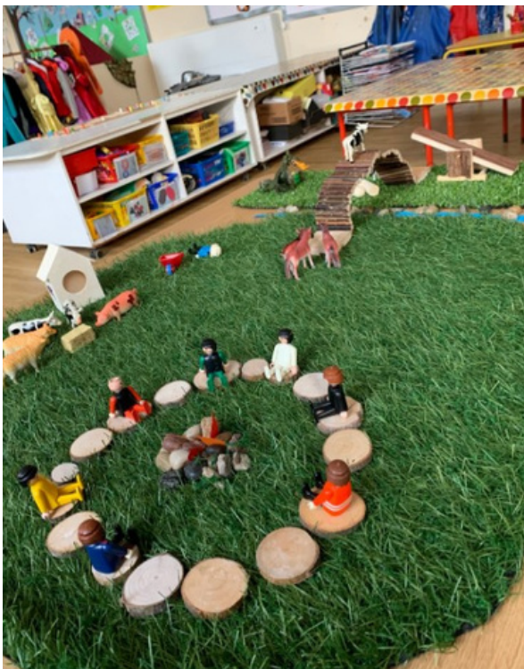
Camp Theme Pebbles, plastic figures, wooden circles, cut-outs of paper, farm animals, wooden bridge and house