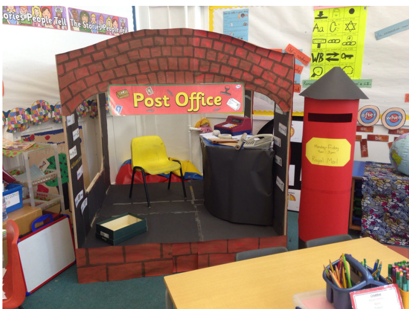
Post office role play area