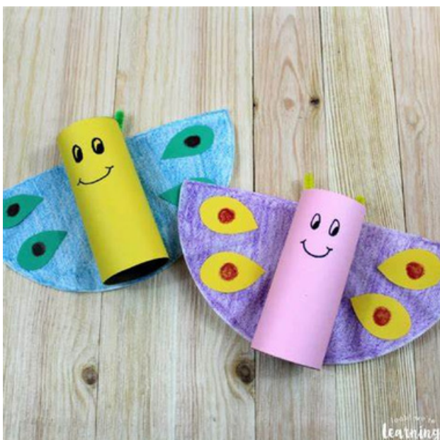
Paper plate butterflies Paper plates cut in half, a roll of card stapled to plate for the body. Decorated using pencils, pens, stickers etc