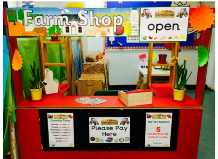
Fairy tale farm shop