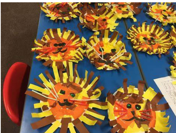
Paper plate lions Strips of yellow and brown paper, orange paper, buttons for eyes, pipe cleaners for whiskers