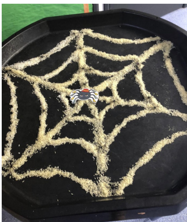
Halloween Messy play- Cobweb made of rice