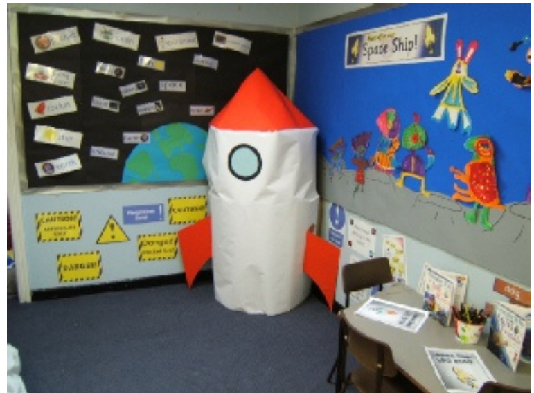
Rocket ship role play area