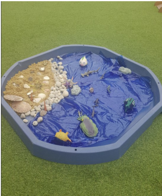
Under the Sea Pebbles, blue cellophane, Sand, Boats, Plastic rocks