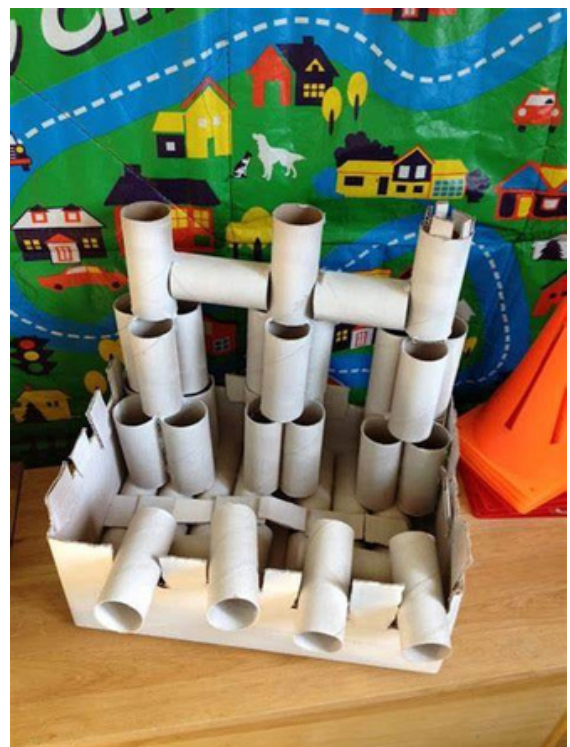
Castle Built using kitchen roll inserts, and a cardboard box.