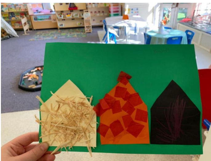
Fairy tales The 3 little pig houses Coloured card, straw, sticks (or brown pencil) and tissue paper bricks