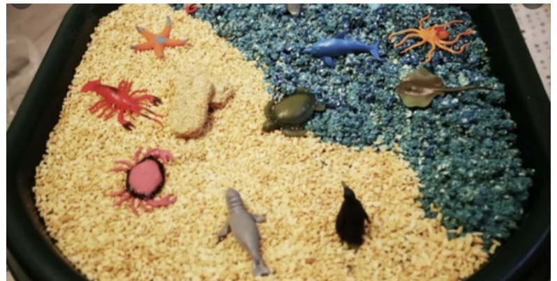
Under the Sea Rice crispies, blue pebbles, plastic sea creatures