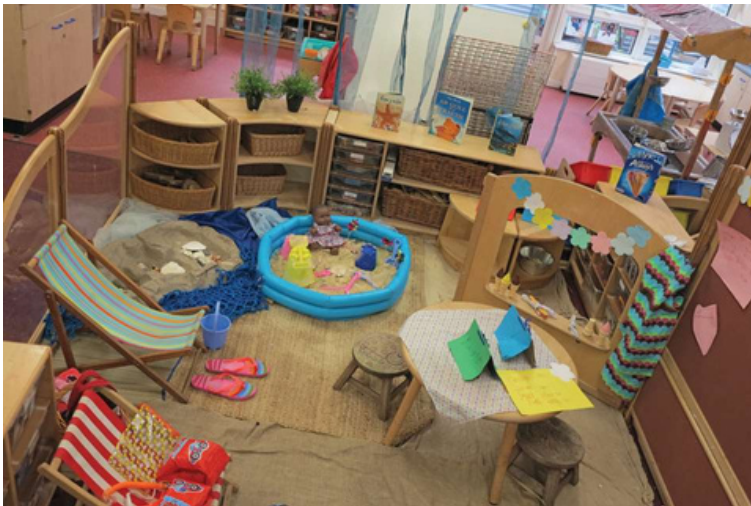
Day at the beach role play area