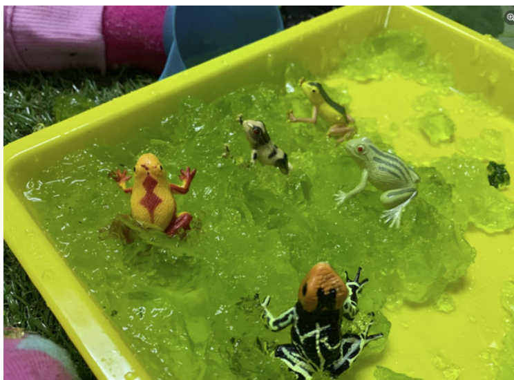
Halloween messy play Green jelly and plastic animals