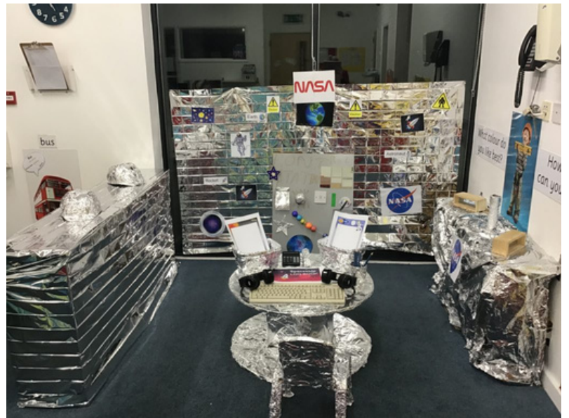
Space themed role play area