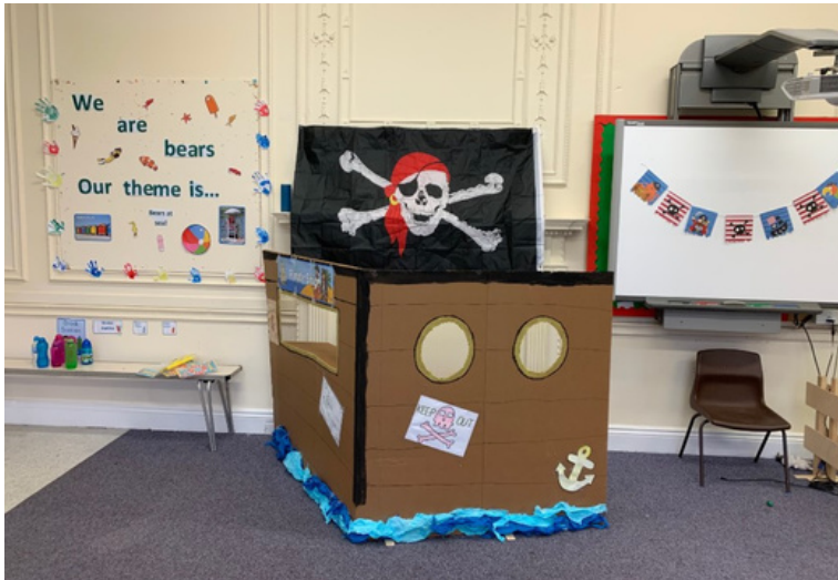
Under the Sea Theme Pirate ship role play area